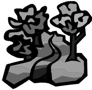
Why no Ryan Lake Trail ?

ViNA has been working with various partners for several years to implement a long-term plan to upgrade the shoreline of Ryan Lake and connect it by a trail to the future Victory Prairie site on Osseo Road. Phase I of the shoreline restoration was completed a few years ago, but the project has stalled over the construction of the trail linking the lake with the prairie. ViNA helped the City obtain a $43,000 grant from the DNR to help fund construction of the trail, and dedicated $10,000 in NRP funds