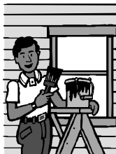
A program of Twin Cities Habitat for Humanity

A Brush with Kindness, a program of Twin Cities Habitat for Humanity, offers home preservation services such as house painting, minor repairs and general clean up for low income homeowners.