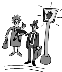
44th and Penn is not pedestrian friendly

The ViNA Business Committee is currently reviewing proposals from 3 consulting firms to perform a pedestrian needs analysis for the 44th Ave, Penn Avenue and Osseo Road intersection. This study is made possible by a "Great Streets" grant awarded by the City of Minneapolis to